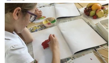
Year 6 studied pointillism as well as still life art then they created fruit pictures.