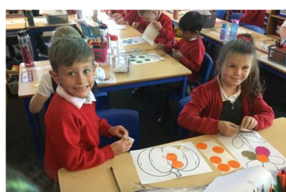
Year 2 made dotty flowers and pumpkins using round stickers of different sizes and colours. The different sizes were used to create different effects.