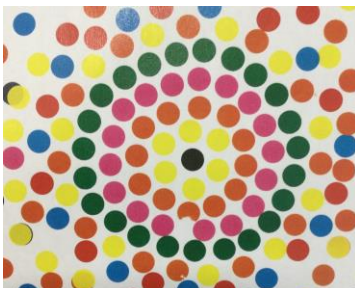
Year 5 created a number of different artworks from being given only 1 black dot.